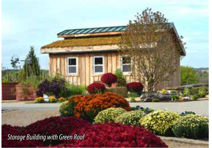
Storage Building with Green Roof