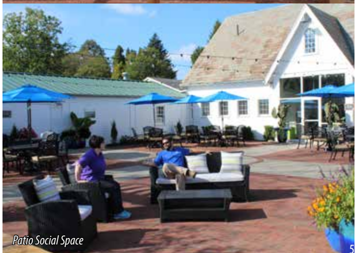
Patio Social Space