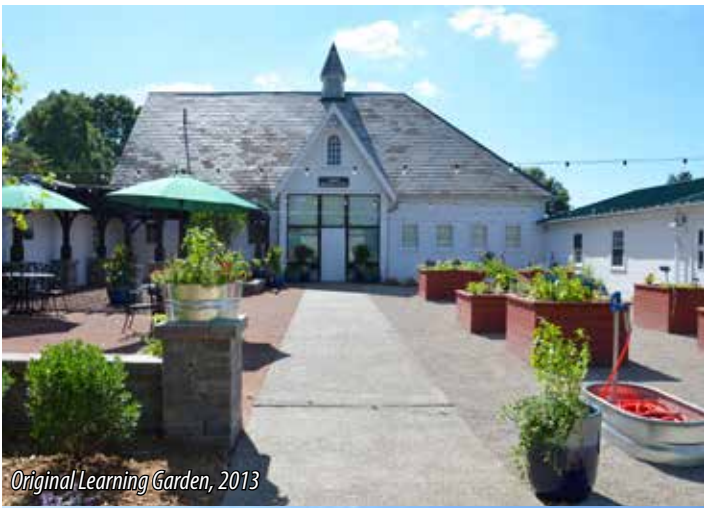
Original Learning Garden, 2013