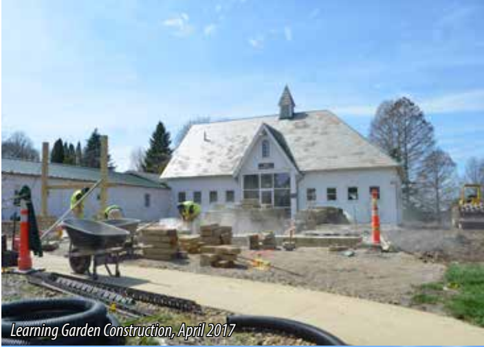
Learning Garden Construction, April 2017