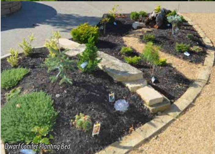
Dwarf Conifer Planting Bed