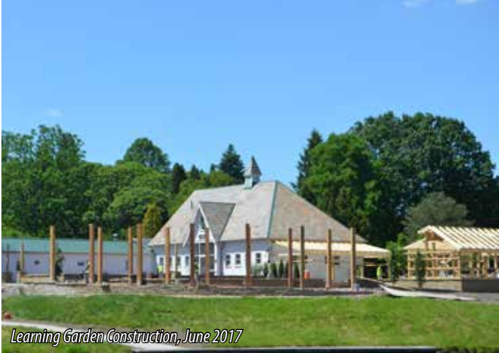
Learning Garden Construction, June 2017